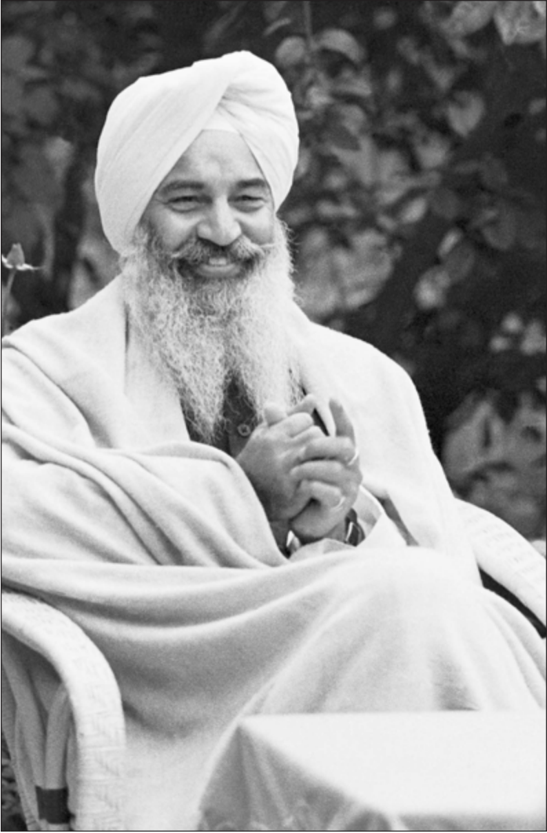
Maharaj Charan Singh