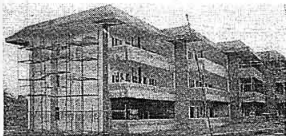
C-type apartments for doctors

The Hospital will have over 220 apartments for doctors, paramedical and supervisory staff within the complex including a shopping arcade for items of daily need - ration, milk, fresh vegetables, sweets, tailoring and hair-dresser shops, canteens, library and indoor games stadium. The complex will have a systematic parking zone, defined metalled roads, over 2000 ornamental trees and a wide variety of flower plants adding aesthetics and ambience to the scenic setting.