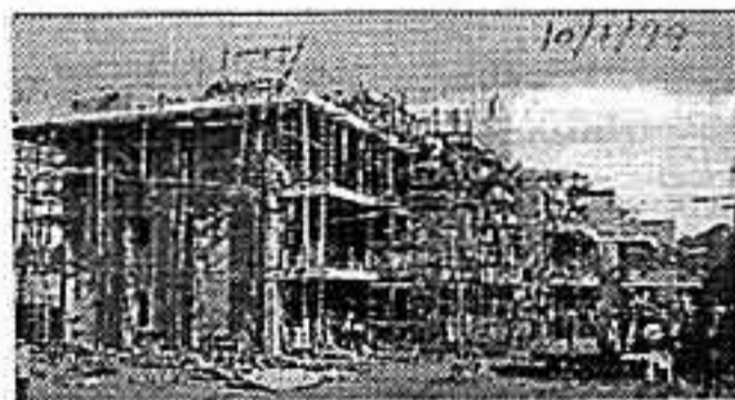
Followers working on residential blocks

scapes. Thousands of sewadars mainly from Una, Hamirpur, Hoshiarpur and other districts of Punjab, Haryana and Rajasthan have been working day and night unmindful of personal