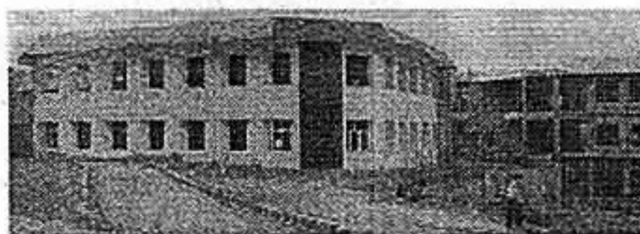
The white portion is OPD which has become functional

The Charitable hospital, where the medicines will be provided free of cost to the indoor and outdoor patients, will have a highly specialised team of qualified doctors possessing practical experience and