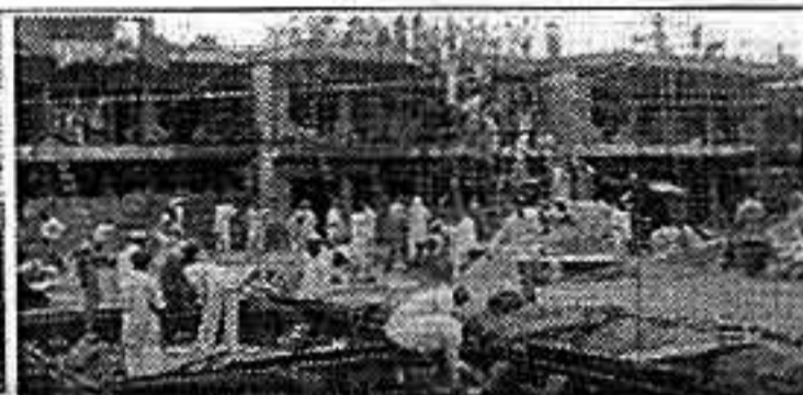
Work on hospital block in progress