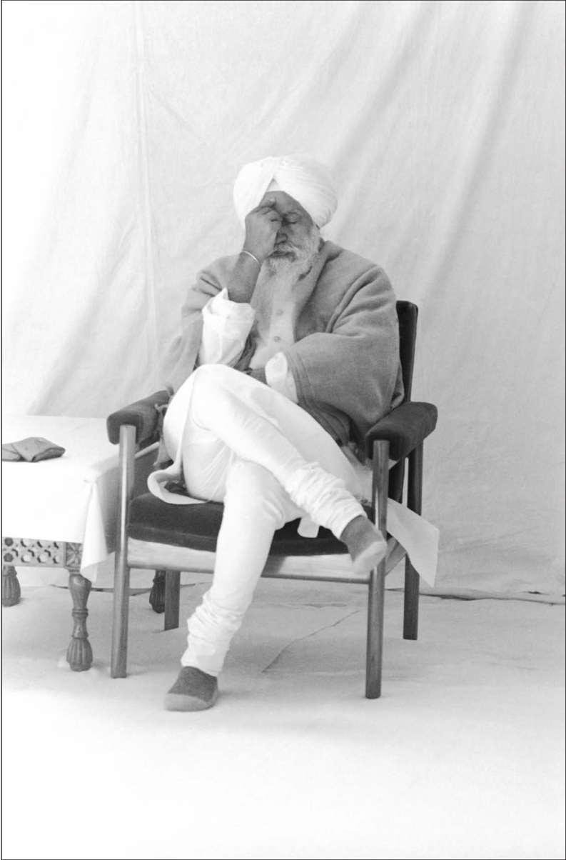
Maharaj Charan Singh